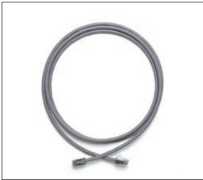
G10FP Patch Cord

SYSTIMAX GigaSPEED X10D G10FP F/UTP patch cords are for use at both ends of a SYSTIMAX® GigaSPEED® X10D F/UTP channel. Along with cable and patching hardware, CommScope Labs has characterized the performance of these cords in thousands of different channel configurations using the Modal Decomposition Modeling (MDM) tool.