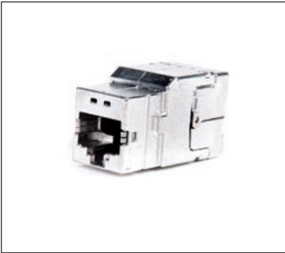
SYSTIMAX GigaSPEED X10D Shielded High Density Information Outlet

The SYSTIMAX GigaSPEED X10D shielded high density information outlet is the latest result of many years of continuous product development at CommScope Labs and features a patent pending flexible mounting system that enables a single connector to mount in three separate openings (high density, M-Series, and keystone). The HGS620 has a rugged, full-metal construction and allows for multiple size cable terminations for F/UTP and S/FTP installation (0.270 inches up to .300 inches diameter over jacket).