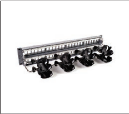
SYSTIMAX 360 GigaSPEED X10D Modular Panel, 48 Port, Rear View