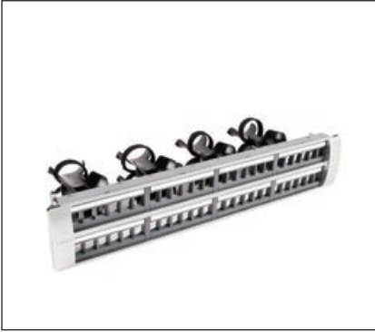
SYSTIMAX 360 GigaSPEED X10D Modular Panel, 48 Port, Front View