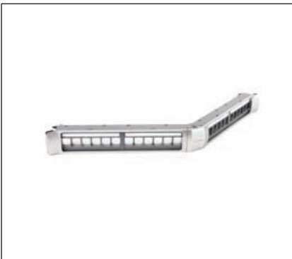
SYSTIMAX 360 GigaSPEED X10D Angled Modular Panel, 24 Port

The SYSTIMAX 360 GigaSPEED X10D F/UTP modular panels are available in straight and angled constructions and are iPatch®-Ready, making them field upgradeable to iPatch without the need to remove patch cords, meaning no network downtime. The F/UTP modular panels offer easy cable routing and bundling through CommScope's rear cable management solution and feature the elegant SYSTIMAX 360 design.